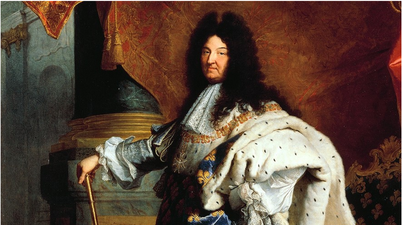
Portrait of King Louis XIV of France, 1701. Image from the public domain Image from the public domain.

Absolutism is the idea that one ruler should have all the power. No other person, group or law can put that power in check.